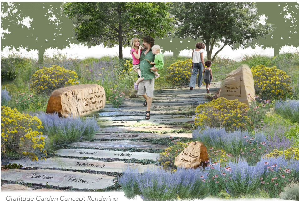
Gratitude Garden Concept Rendering

We value and appreciate every gift the community makes in support of the High Line Canal. To commemorate the historic effort that is Great Lengths for the High Line, we're pleased to offer donor benefits at the following levels.